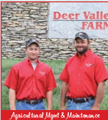
Agricultural Mgmt & Maintenance