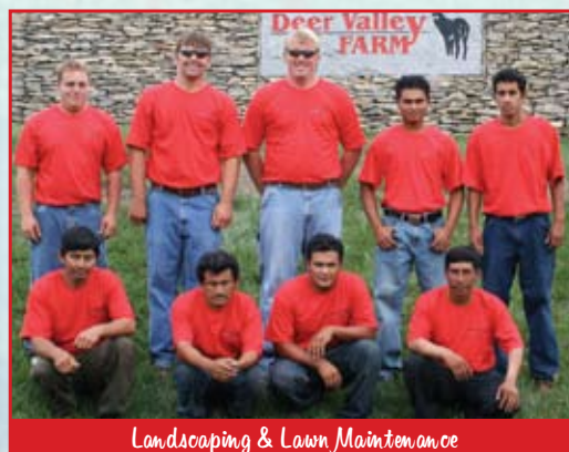
Landscaping & Lawn Maintenance